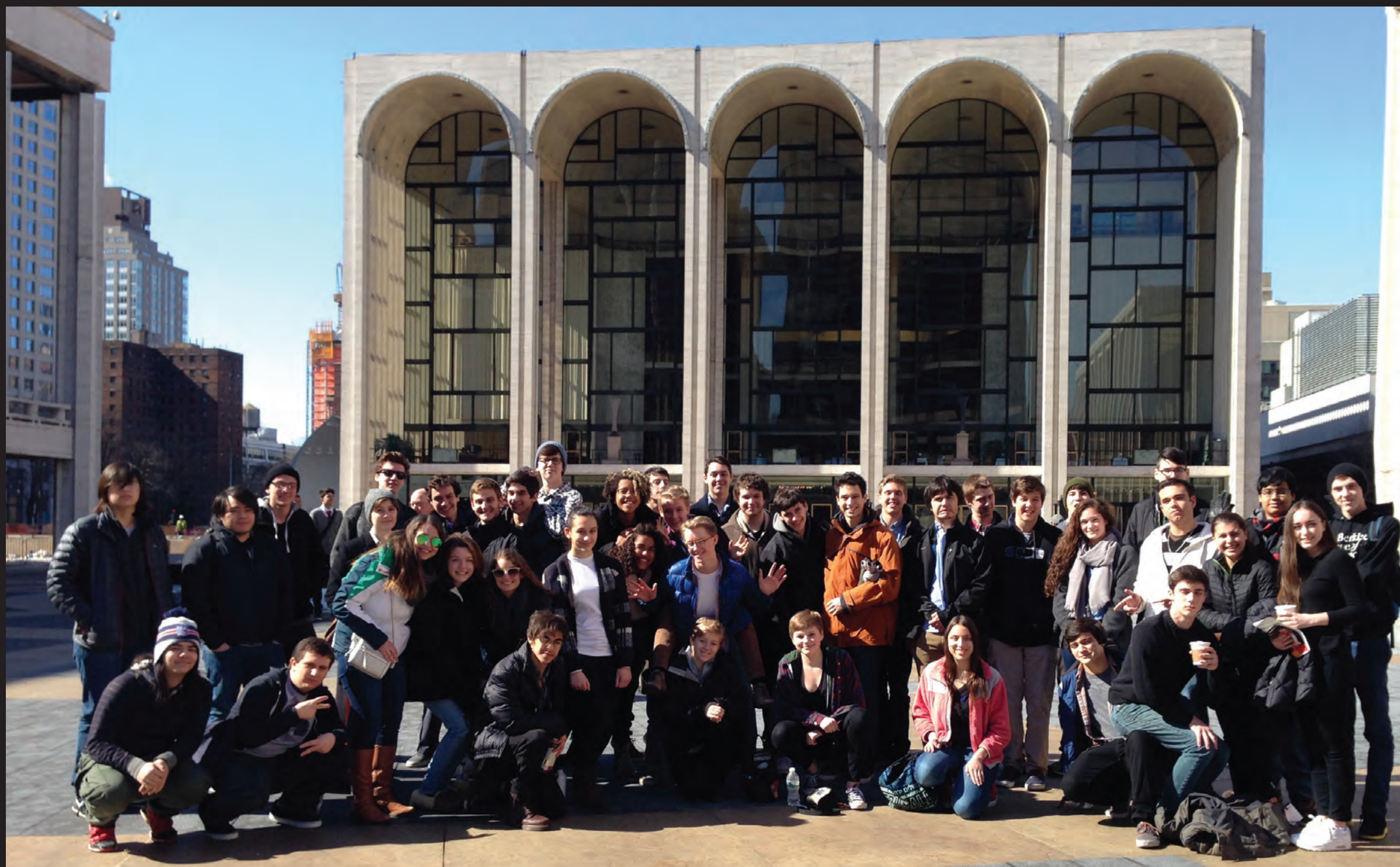
Field trip to Lincoln Center for NY Philharmonic rehearsal, backstage tour, and Lincoln Center Jazz concert